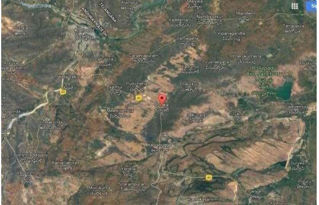
MAP 1A: LOCATION OF THE AIRPORT

8. Site of the Airport : The Airport is developed at Kurnool in Kurnool district of Andhra Pradesh having co-ordinates Latitude 15°42'53.120"N, Longitude 078°09'46.749"E. Kurnool (Kurnool) Airport is approximately 25 km from the town of Kurnool and nearest aerodrome is Hyderabad, at a distance of approximately 221 Km.